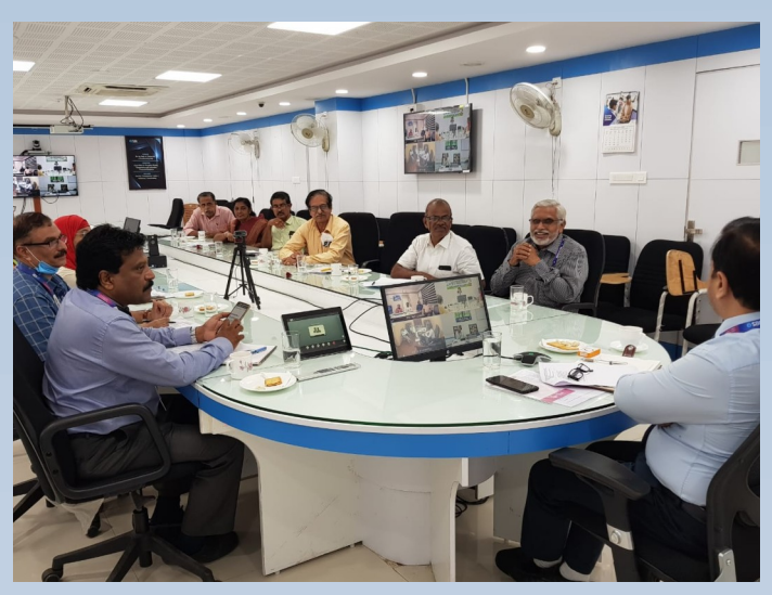
Structured meeting at AO Kottayam

also took part in the meeting through video conference.