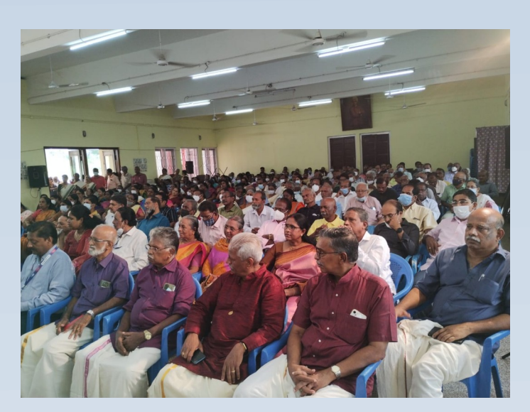
ഓണാഘോഷം വീക്ഷിക്കാനെത്തിയ നിറഞ്ഞ സദസ്സ്.

2022- സെപ്റ്റംബർ മാസം 30 ന് വെള്ളിയാഴ്ച രാവിലെ 9.30 മുതൽ ഹസ്സൻ മരിക്കാർ വിവേകാനന്ദ്യ ഹാളിലായിരുന്നു സമ്മേളനം.