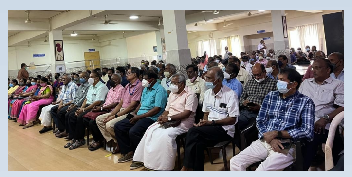
Another view of the members

However he hoped, an early settlement would be arrived at soon with the coordinated efforts of serving Federations and pensioners' Federation as well. He further shared the organisational developments and also regarding opening of new dispensaries in Wayanad and Malappuram.