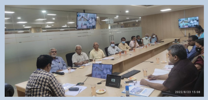
Structured meeting at AO Kollam

Structured meeting for the quarter was held at AO Kollam on 23.08.22.